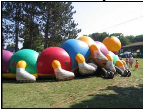
Everyone loves Alden Days