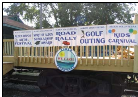
AV Event Signs on the train