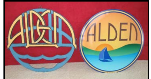
Lamp post inserts – before and after