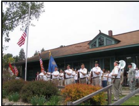
Military Color Guard at the Depot for the Memorial Day Parade