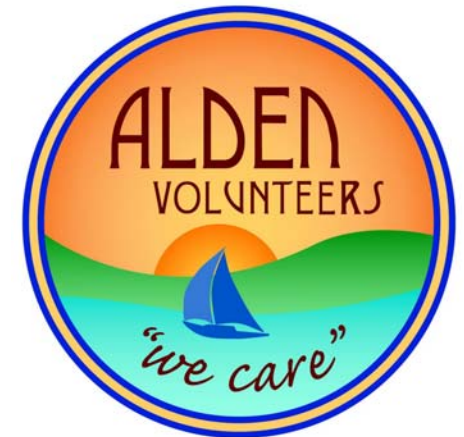
This is really what it's all about!