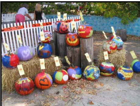
Great Halloween pumpkins from the children at Rapid City Elementary School at the Pumpkin Patch during Heritage Days