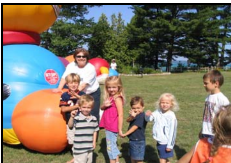
Kids LOVE the "caterpillar" at the Depot during Alden Days